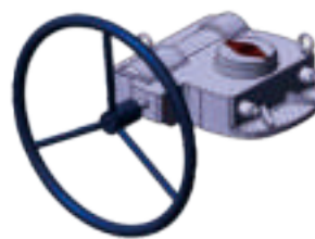
For Quarter-turn Valve