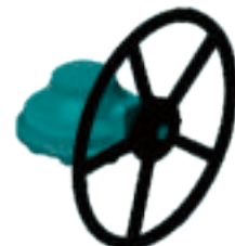
For Multi-turn valve