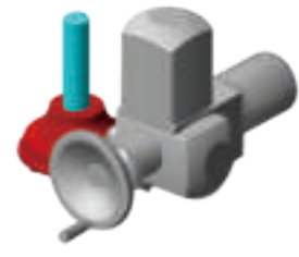
For Multi-turn valve